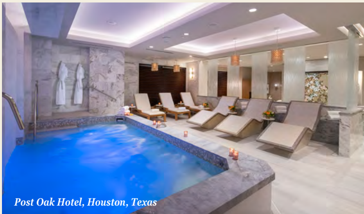
Post Oak Hotel, Houston, Texas

Escape to a sacred oasis of awakening at the Hari Hara center in lush Cambodia. Embark on the retreats six-day journey of self-discovery which combines digital detox with a schedule of mindful meditation, yoga and wholesome vegan cuisine. This popular wellness destination has guided thousands of people into a newfound sense of aliveness and renewed vigor for life.