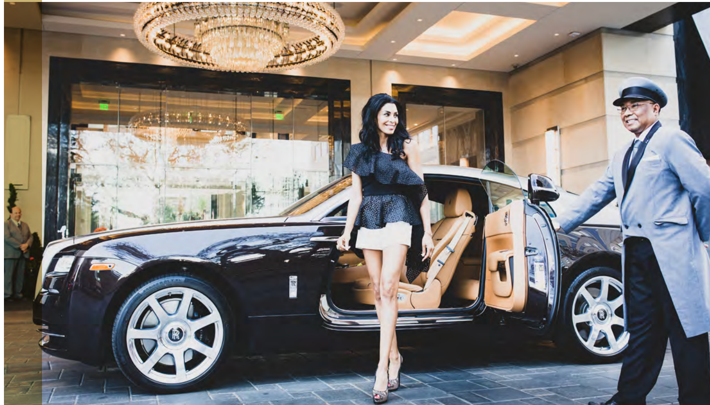
A PERSPECTIVE FROM TILMAN FERTITTA By Courtney Goodson