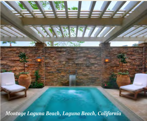
Montage Laguna Beach, Laguna Beach, California

Montage’s highly experienced therapists bring unparalleled expertise, having undergone extensive specialized education and training to deliver truly personalized therapies tailored to individual needs. With thoughtful attention and a global approach to wellness, the Elements of Wellness rituals have been crafted to inspire rejuvenation, transformation, and a profound sense of stillness, offering a truly bespoke experience designed to restore balance and vitality.