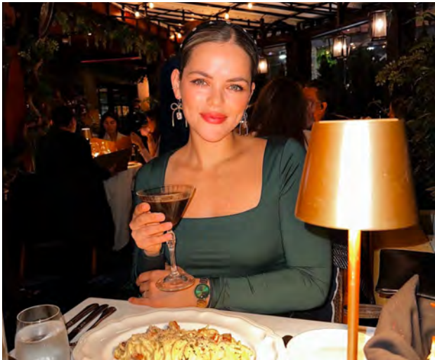
LA GRIGLIA @court_cambell

We love seeing all your favorite Landry's and Golden Nugget moments on Instagram. That's why we're inviting you to share and tag them using #SELECTLIFESHOTS . You may just see your photo in our next issue!