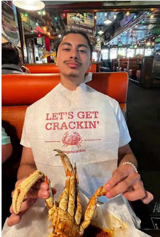
JOE'S CRAB SHACK @joshua_puente