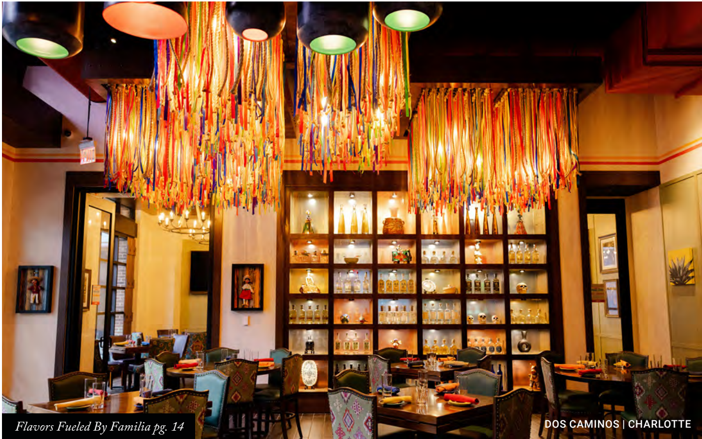
Flavors Fueled By Familia pg. 14