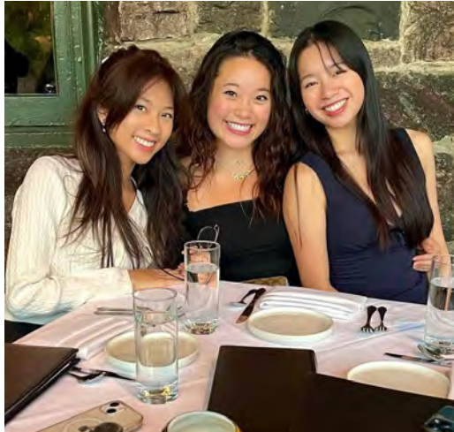
GANDY DANCER @hungryglo