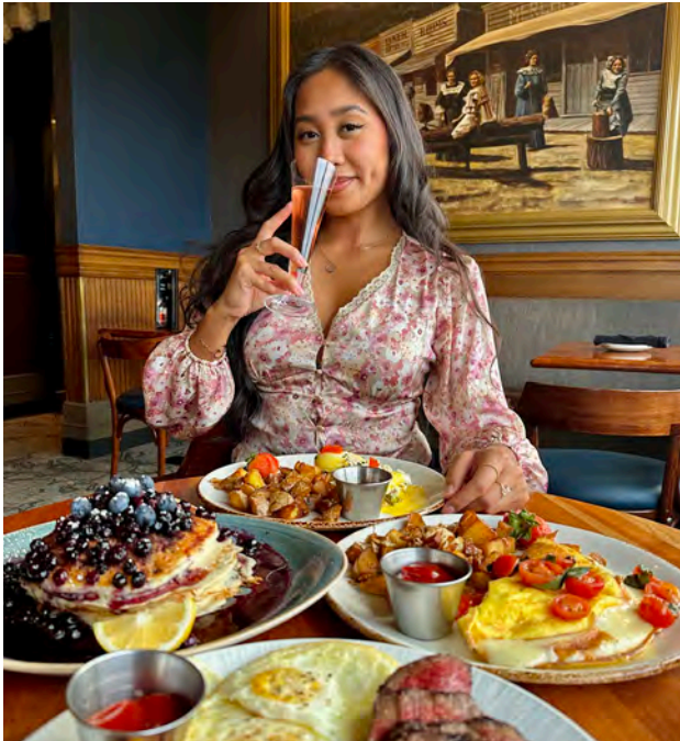
SIMON & SEAFORT'S @ak.lv.foodie