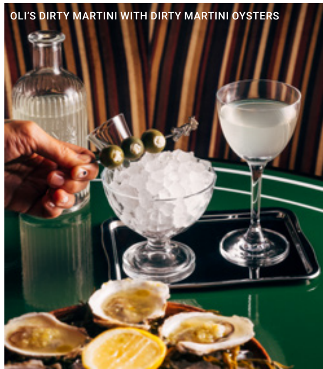
OLI'S DIRTY MARTINI WITH DIRTY MARTINI OYSTERS

From restaurant remodels to brand new locations, see what's new this season. BY SELECT LIFE STAFF