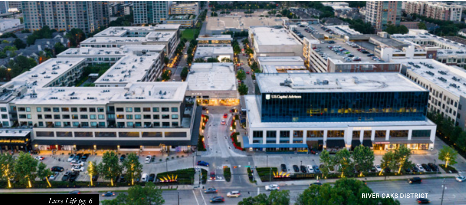
Luxe Life pg. 6