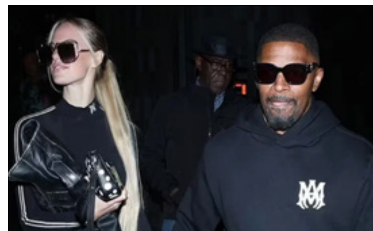
JAMIE FOXX AND ALYCE HUCKSTEPP stepped out for a cozy night out in Los Angeles, where they were spotted holding hands while leaving the popular celebrity hotspot, Catch Steak , on Saturday, September 28.

Most recent celebrity sightings at your favorite Landry's restaurants, events, hotels, and casinos.