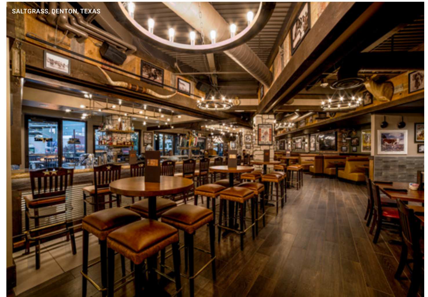
SALTGRASS, DENTON, TEXAS