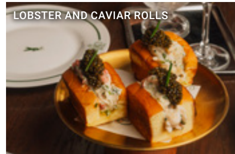
LOBSTER AND CAVIAR ROLLS