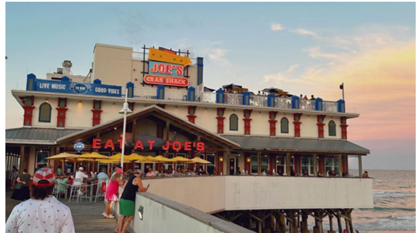
JOE'S CRAB SHACK @cadenceelliott_4

Do it for the 'Gram – and Select Life! We love seeing all your favorite Landry's and Golden Nugget moments on Instagram. That's why we're inviting you to share and tag them using #SELECTLIFESHOTS . You may just see your photo in our next issue!