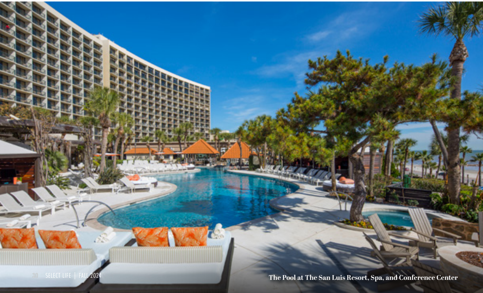
The Pool at The San Luis Resort, Spa, and Conference Center

As we look ahead, the future of bleisure travel appears promising. Companies are increasingly recognizing the value of this approach, with many adapting their travel policies to support longer stays that include leisure time. This paradigm shift not only benefits employees but also enhances overall corporate performance by fostering a more engaged and satisfied workforce. Embracing bleisure is a step towards a more holistic approach to work and life, one that acknowledges and nurtures the human need for balance and fulfillment.