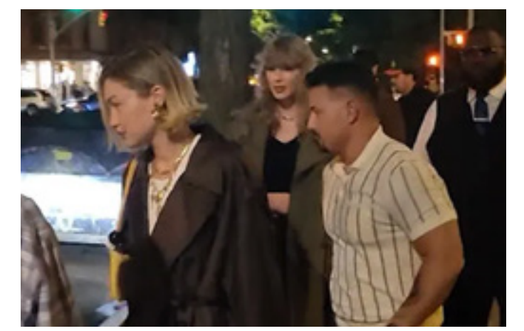
TAYLOR SWIFT AND GIGI HADID hit up The Corner Store restaurant in NYC Saturday night.